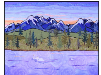
LAYERED LANDSCAPES CLASS KIT